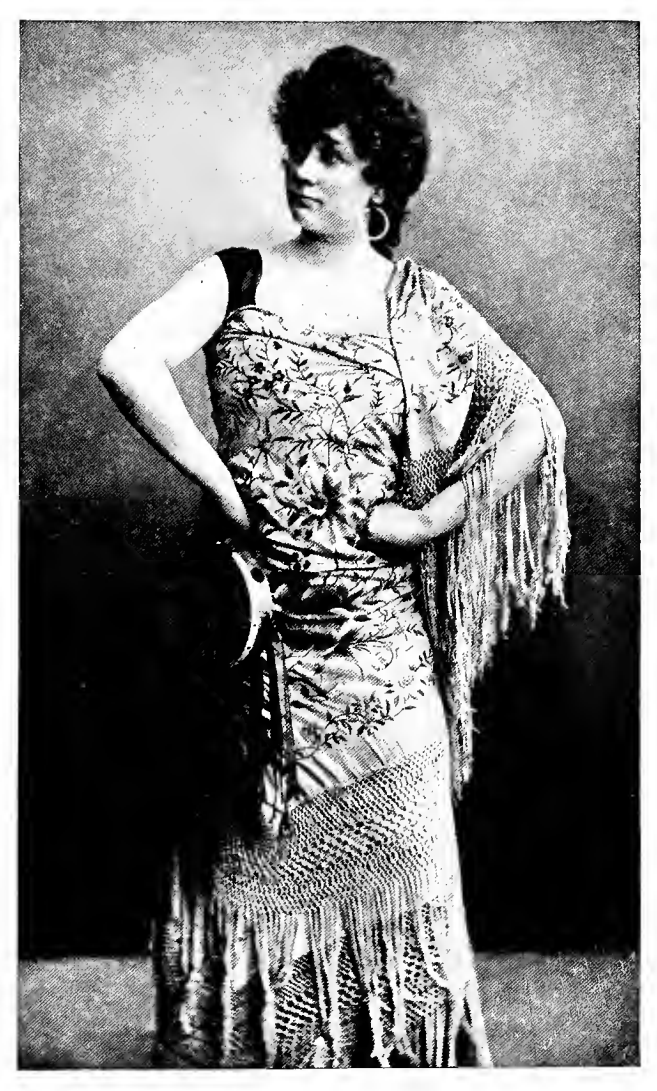
OLIVE FREMSTAD AS CARMEN, ACT I from an early photograph by Lützel, Munich